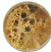
Before AP3000 II