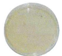
After 8 hours with AP3000 II technology

Before and after laboratory tests showing reductions of airborne contaminants with the AP3000 II.